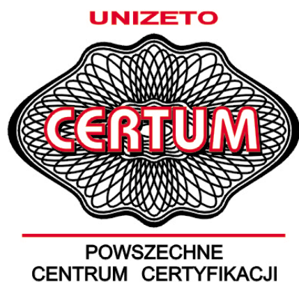
Fig. 9.1 CERTUM Logo

Unizeto Technologies S.A. owns registered trade mark, consisting of graphic mark and inscription, which constitute the following logo: