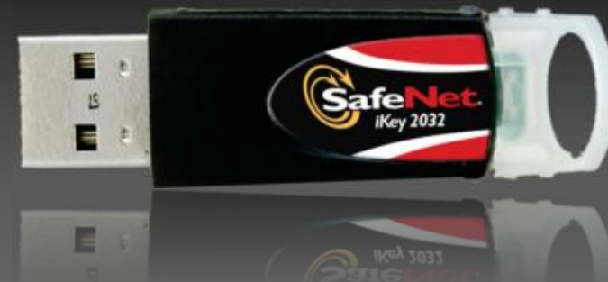
SafeNET iKey™ 2032 USB Cryptographic security comes as standard for all PersonalSign and PersonalSign professional solutions – Portable/Flexible/Reliable

CorporateRA Digital ID for Adobe includes two options for the Enterprise to manage the full life-cycle of Digital IDs issued under their organization name. i.e. Individual signing USB tokens or central-based credentials for either role-based signings or server held individual Digital IDs. Distributed implementations involve providing organization administrators (acting as the organization registration authority) a bulk shipment of Safenet USB tokens which work in conjunction with Acrobat Standard/Professional/3D. Centralized, server-based implementations work with SafeNet hardware security modules (optionally sold) that are highly integrated with Adobe's LiveCycle Enterprise Server suite. The net result is a highly automated solution with robust signing functionality..